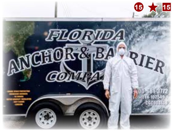
Insulation & Vapor Barrier Repairs Soft Floor Repairs & Laminate Flooring

Wishing you good health and safety, The Florida Anchor & Barrier Team